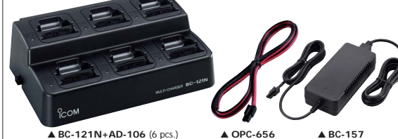
▲ BC-121N+AD-106 (6 pcs.) ▲ OPC-656 ▲ BC-157

BC-121N MULTI-CHARGER + AD-106 CHARGER ADAPTER + BC-157 AC ADAPTER (Six AD-106s are required) Charges up to 6 battery packs in 2 hours (approx.) when BP-231 is attached. OPC-656 DC POWER CABLE : For use with the BC-121N. (12–20V DC required).