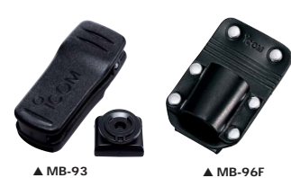
▲ MB-93 ▲ MB-96F

MB-93 : Swivel type belt clip. MB-94 : Alligator type. Same as supplied. MB-96N : Swivel type belt hanger. MB-96F : Fixed type belt hanger.