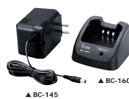
▲ BC-145 ▲ BC-160

BC-160 DESKTOP CHARGER + BC-145 AC ADAPTER Charges the BP-231 in 2 hours (approx.). BC-119N + AD-106 + BC-145 is also available. : Charges the BP-231 in 2 hours (approx.).