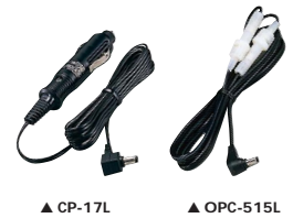
▲ CP-17L ▲ OPC-515L

CP-17L CIGARETTE LIGHTER CABLE, OPC-515L DC POWER CABLE For use with the BC-160 or BC-119N. (12–16V DC required).