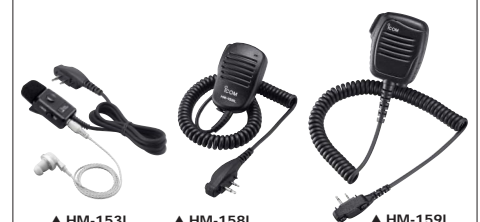
▲ HM-153L ▲ HM-158L ▲ HM-159L

HM-153L : Durable earphone-microphone with revolving clip. HM-158L : Compact and durable body with screw-type connector. HM-159L : Full size durable speaker microphone.