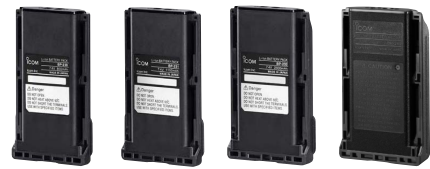
▲ BP-230 ▲ BP-231 ▲ BP-232 ▲ BP-240