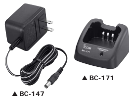
▲ BC-147 ▲ BC-171

BC-171 DESKTOP CHARGER + BC-147 AC ADAPTER Charges the battery pack in 8–10 hours (approx.). Coming soon.